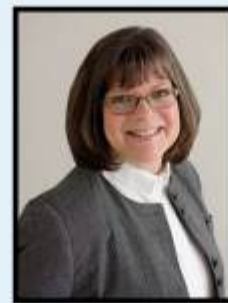
From Northern Light Newsletter Volume 37, Issue 1 | January-February 2025